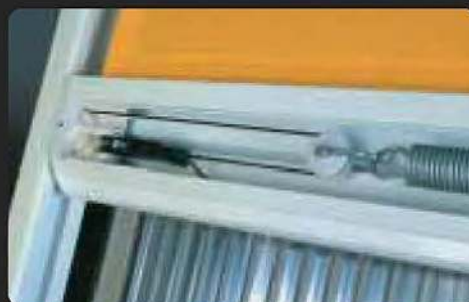
The fabric and the front rail are kept under constant tension by way of a spring, wheel-runners and the Hi-Tech cord.