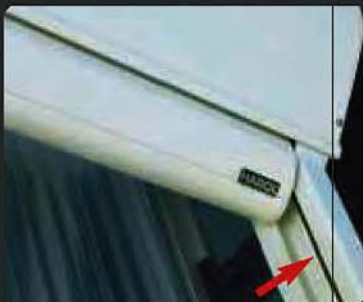
The Hi-Tech Cord - developed specially for this product guarantees a long life for your conservatory awning.

Harol Conservatory awnings when rolled up the fabric is completely inside the VZ box, protected against any effects of the weather outside. The VZ is fixed to the guide rails, which are fastened to the conservatory frame by means of fastening supports.