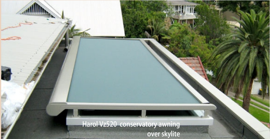
Harol Vz520 conservatory awning over skylite