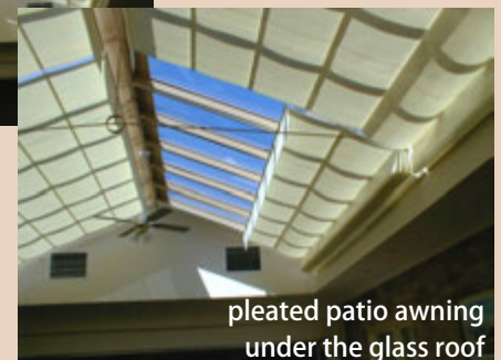
pleated patio awning under the glass roof

This unique retractable awning system can be installed under an existing pergola or glass covered roof without any expensive alterations.