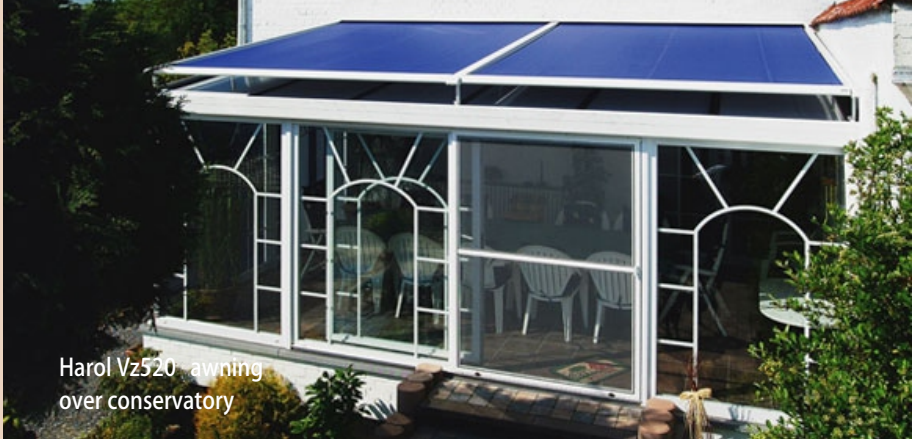
Harol Vz520 awning over conservatory