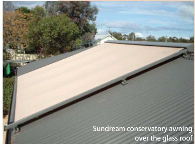
Sundream conservatory awning over the glass roof

Cassette and guide rails of every Conservatory awnings are made from extremely sturdy aluminium profiles. All components are extensively protected against corrosion and absolutely maintenance-free!